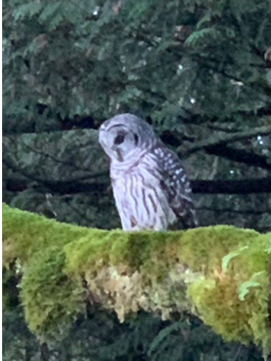
Hootie the resident owl

TOTALS for September vs AVERAGES (April to September)